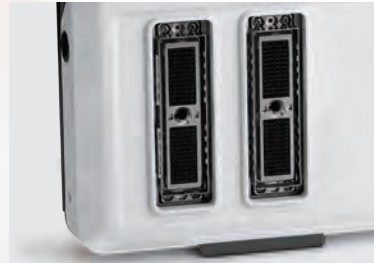
Two probe ports