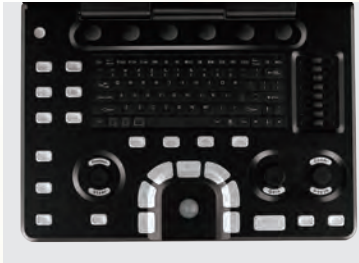
Physical keyboard for fast information input