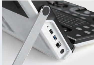
Multi-functional handle for quick stand when needed