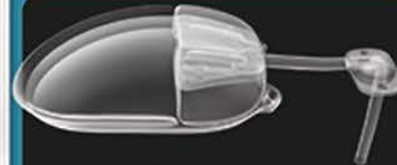
Model PS2 Model S2 with Pars Plana Clip™