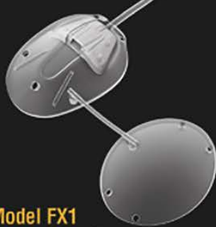
Model FX1 Flexible Bi-Plate™