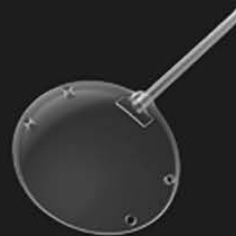
Model B4 Non-Valved Plate