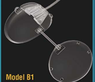
Model B1 Bi-Plate™