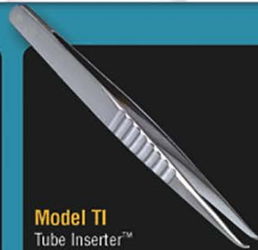
Model TI Tube Inserter™