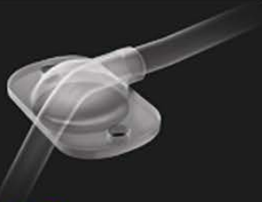
Model PC Pars Plana Clip™