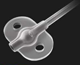
Model TE Tube Extender™