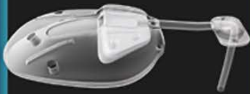
Model PC7 Model FP7 with Pars Plana Clip™