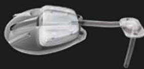
Model PC8 Model FP8 with Pars Plana Clip™