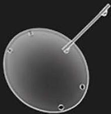
Model FX4 Flexible, Non-Valved Plate