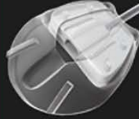
Model FP8 Ahmed™ Glaucoma Valve Flexible Plate™ (Pediatric)