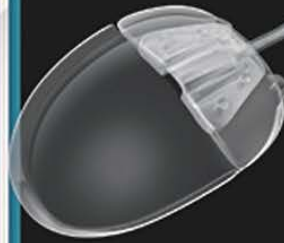
Model S2 Ahmed™ Glaucoma Valve