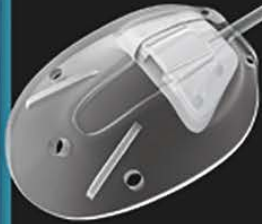
Model FP7 Ahmed™ Glaucoma Valve Flexible Plate™