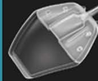
Model S3 Ahmed™ Glaucoma Valve (Pediatric)