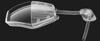
Model PS3 Model S3 with Pars Plana Clip™