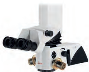
Variable binocular tube

A wide range of observation accessories meets all users' ergonomic requirements, offering the best possible view. The modular system allows a subsequent and straightforward upgrade.