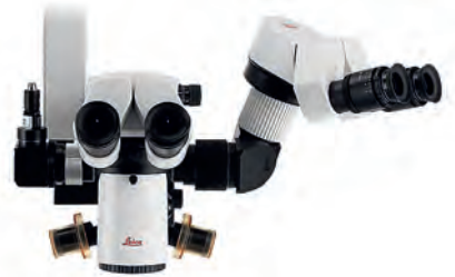
Assistant microscope tube and camera