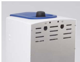
Wall bracket set for wall mounting Elmasteam 4 5 basic