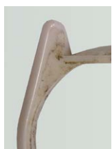
Removal of polishing paste