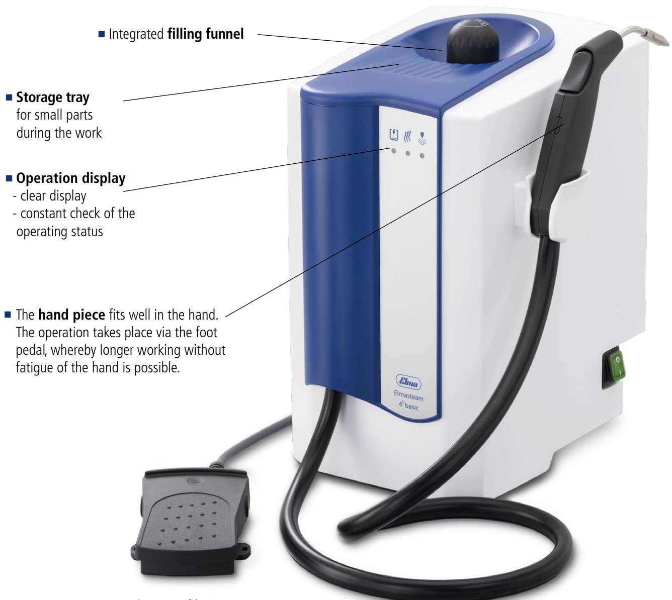
Elmasteam 4 5 basic HP

With the flexible hand piece components and parts can be steam cleaned all around quickly and effectively.