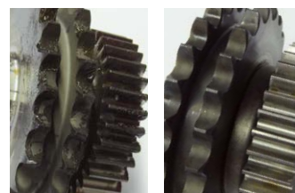
Removal of grease, oil and swarf