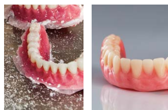
Cleaning of dental prostheses