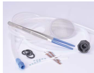
Rinsing set · Sieve · Spare-O-Rings · Dump hose · Tweezers · Test strips for chloride content and water hardness