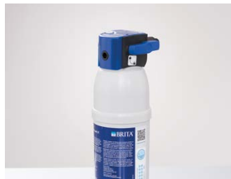
Water filter cartridge by Brita