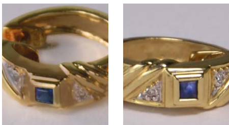
Removal of wear dirt