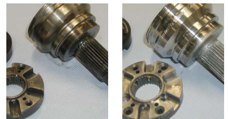
Removal of oxidation and other contaminants