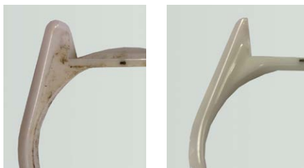
Removal of polishing pastes