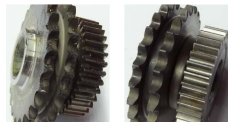
Removal of grease and silicone