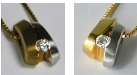
Removal of polishing pastes